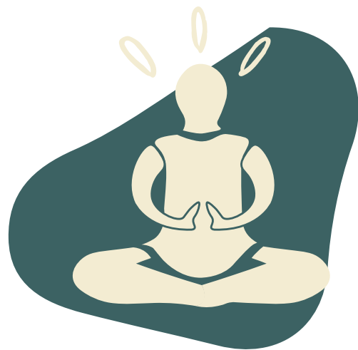
Taking Care Of Your Mental Wellbeing During Covid-19