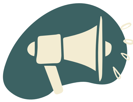
Reporting Concerns And FAQs